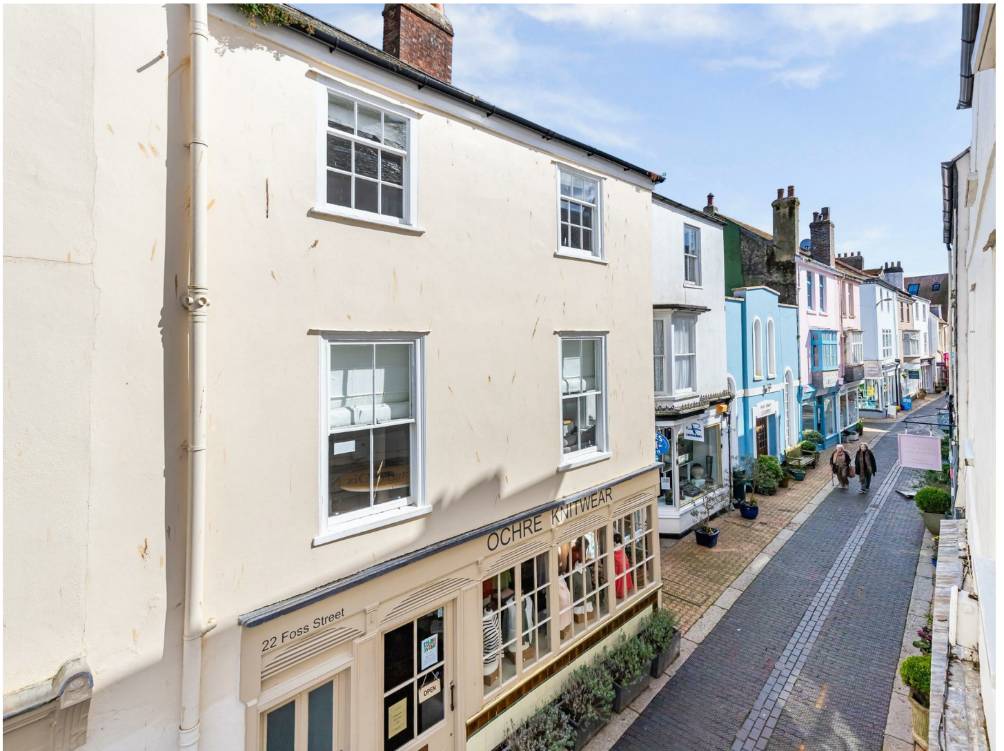
22 Foss Street